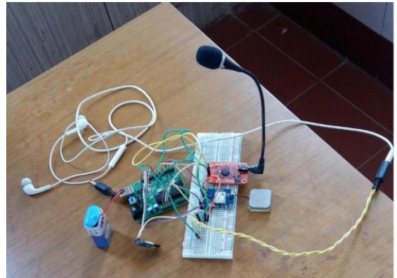
Fig. 6: Hardware implementation

It is responsible for all the functionalities of the voice recognition module. It is because of this library that the Voice Recognition V3 module stores voice and executes the required program.