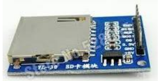
Fig. 5: SD Card module

It allows to read and write to the SD card using your arduino through programming. It is easily interfaced as a peripheral to your arduino sensor shield module. It can be used for SD Card more easily, such as for MP3 Player, MCU/ARM system control