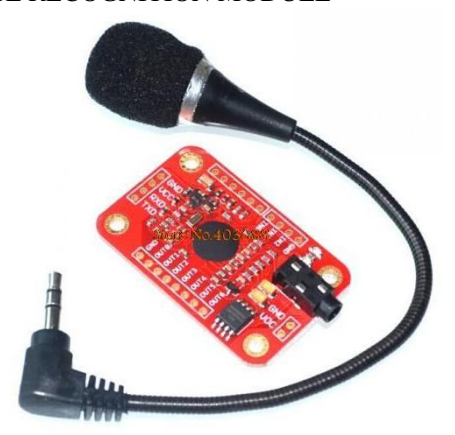
Fig. 4: Voice Recognition Module V3

The blind person gives destination's name as the input to the voice recognition module. The system compares the destination with the stored locations in the database. We have used Voice Recognition Module V3. Voice Recognition Module is a compact and easy-control speaking recognition board. This product is a speakerdependent voice recognition module. It supports up to 80 voice commands in all. Max 7 voice commands could work at the same time. Any sound could be trained as command. Users need to train the module first before let it recognizing any voice command. This board has 2 controlling ways: Serial Port (full function), General Input Pins (part of function). General Output Pins on the board could generate several kinds of waves while corresponding voice command was recognized. Some of the parameters of V3 are are listed below: