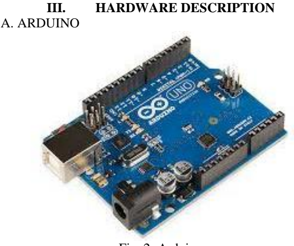
Fig. 2: Arduino

INTERNATIONAL JOURNAL OF INNOVATIVE RESEARCH IN ELECTRICAL. ELECTRONICS, INSTRUMENTATION AND CONTROL ENGINEERING